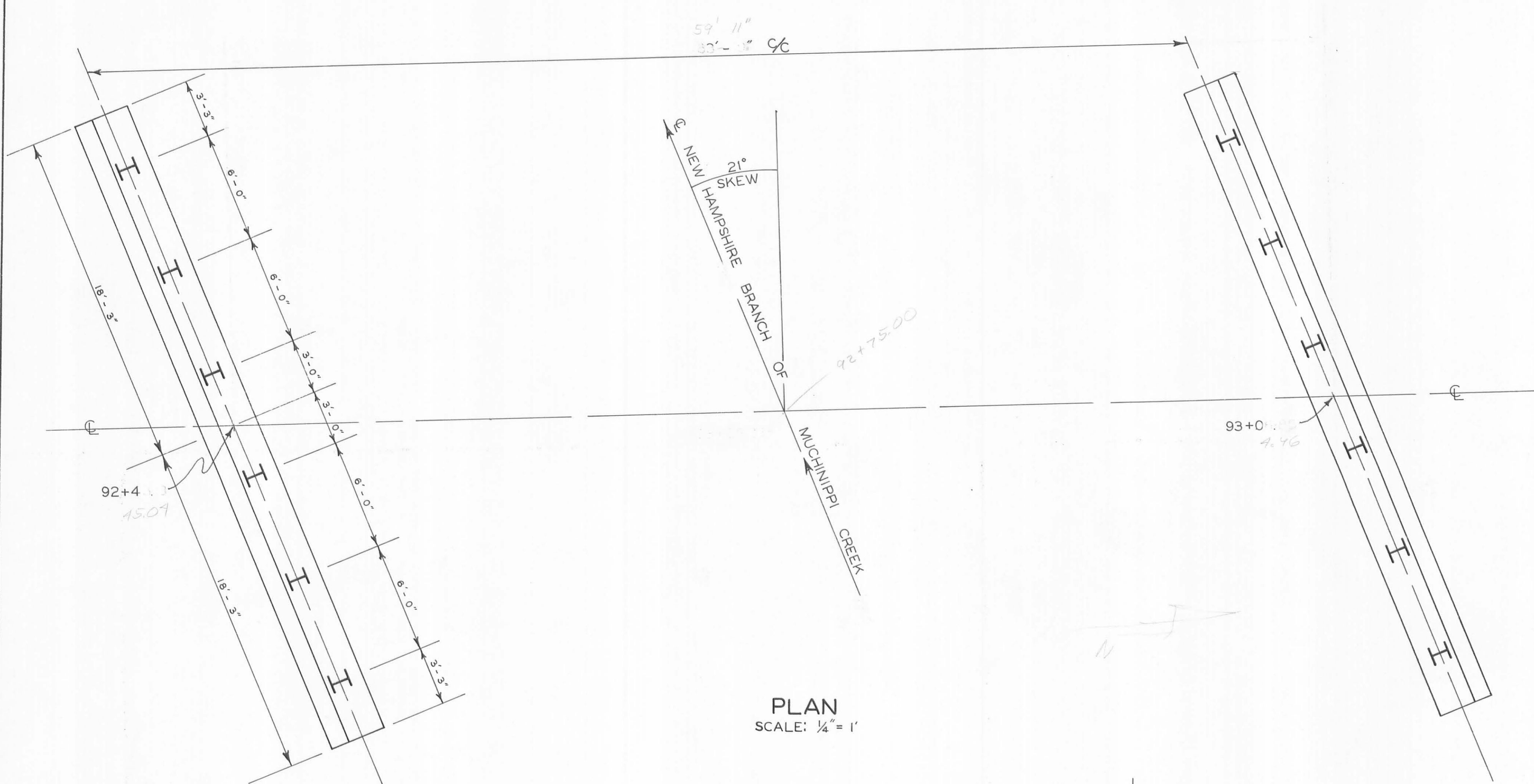
PLAN SCALE: 1/4" = 1'